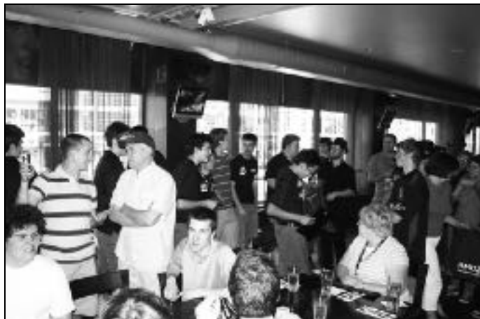
At the Hard Rock Café for the 2010 National Gala Banquet